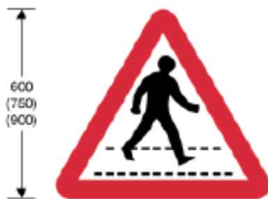
544 Zebra crossing ahead

For example one might consider using either of the two signs below, however diagram 544 can only be used at a Zebra crossing and 544.1 which denotes 'pedestrians in road ahead' can only be used where pedestrians frequently use a road without a proper footways, clearly this is not the case on Whitehorse Lane.